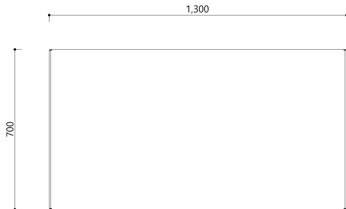
3 정 면 도 SCALE : 1/10 (A3)